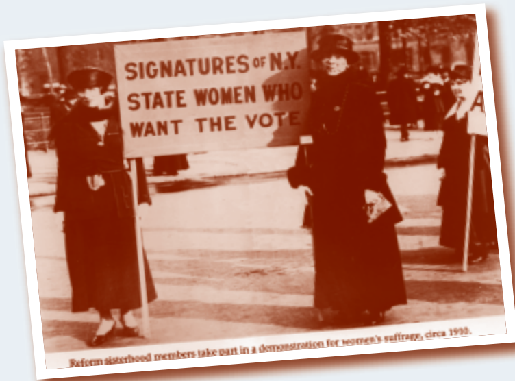
Reform sisterhood members take part in a demonstration for women's suffrage, circa 1900.

The Women of Reform Judaism (WRJ) is the single largest cumulative donor to the Hebrew Union College-Jewish Institute of Religion: it has provided devoted support to the College-Institute annually since 1913. Through the YES Fund (Youth, Education, and Special Projects), WRJ has traditionally provided scholarship aid to North American rabbinical students and students in our Israel Rabbinical Program, as well as cantorial prizes to students at HUC-JIR's School of Sacred Music. In addition, the WRJ has subsidized HUC-JIR's Pesach Project in the Former Soviet Union, whereby scores of students lead Passover sedarim in Jewish communities large and small throughout Russia, Ukraine, and Belarus.